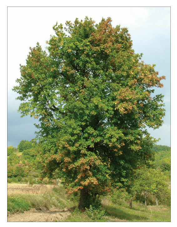
FIGURE 1. Service tree ( S. domestica L.) in Croatian agroclimatic conditions.

many European countries [3]. Croatia is one of the countries where the environmental conditions favor the cultivation of service tree. This species is extensively found in the Mediterranean area, as well as in the continental part of Croatia [4].