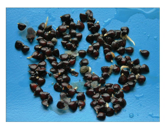
FIGURE 2. Germination of service tree ( S. domestica L.) seeds.

The descriptive statistical data of some morphological characteristics of service tree fruits with different weight is shown in Table 1. Statistically significant differences were determined in length (mm) and width (mm) of the fruits between groups defined by weight (p \leq 0.0001). Small fruits showed statistically significant difference (p \leq 0.0001) having the highest fruit shape index (0.98) in comparison with medium (0.94) and large (0.91) fruits. Therefore, it can be concluded that small fruits had a more round shape. A number of filled seeds in S. domestica L. fruits were