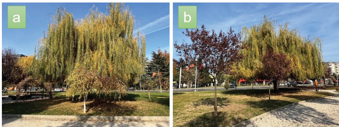
Figure 8. (a) Incorrect distance between plants with similar form ( Salix alba 'Tristis' ambig. and Betula pendula 'Youngii'), Park Macedonia 1; (b) Incorrect distance between plants with different dominant aesthetic elements ( Salix alba 'Tristis' ambig. – specific form, and Prunus cerasifera 'Nigra' – dominant colour), Park Macedonia 1, 2023.

The first example of a design error (Figure 8a) shows that although the form of both individual trees is specific ( Salix alba 'Tristis' ambig. and Betula pendula 'Youngii'), they are not expressed and their decorativeness is lost. The same negative effect is visible in the second example (Figure 8b), where two trees with different dominant aesthetic elements ( Salix alba 'Tristis' ambig., tree with a specific form, and Prunus cerasifera 'Nigra' tree with dominant colour), are planted too close one to another.