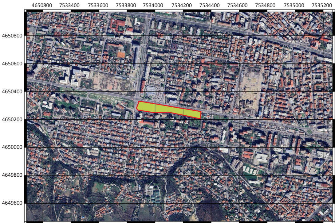
Figure 1. The area of Park Macedonia 1: QGIS (Coordinate Reference System MGI 1901 / Balkan zone 7, EPSG:6316), Google Satellite, 2023.

The used methodology has a multidisciplinary character. The analyses include qualitative (visual, textual and graphic interpretation through the use of geographic information systems) and quantitative interpretation (processing of the obtained qualitative data). The following methods were