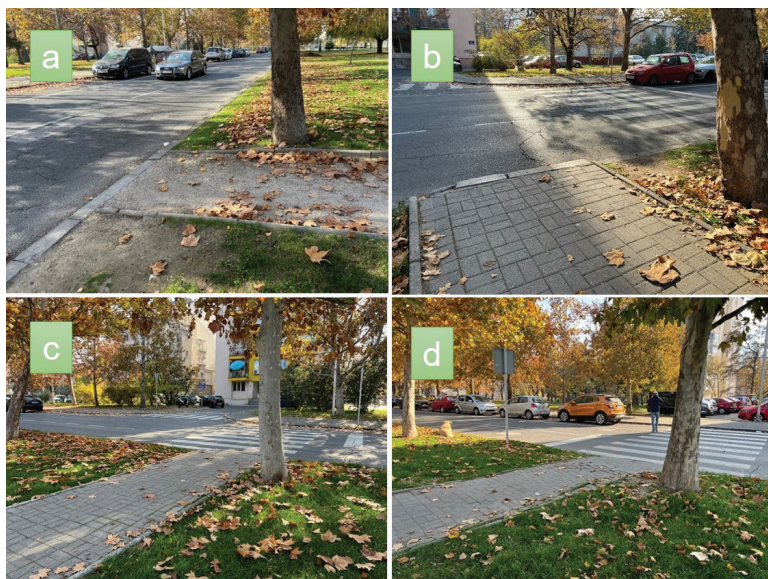
Figure 3. Paths for entries and exits, Park Macedonia 1, 2023: (a, b) Not connected to pedestrian crossings, with limited visibility; (c, d) Connected with pedestrian crossing, with limited visibility.

The safety of the citizens is one of the most important issues and in the process of designing any area, it must be emphasized (Zegeer 2002). It is excellent that the old plane trees are preserved in the newly established park, but some of the paths are made very close to certain individual trees (Figure 3c, Figure 3d) and despite the reduced visibility