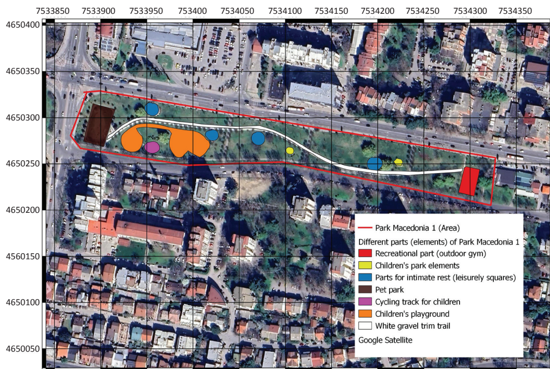
Figure 2. Different parts, i.e. different elements of Park Macedonia 1: QGIS (Coordinate Reference System MGI 1901 / Balkan zone 7, EPSG:6316), Google Satellite, 2023.

Urban parks have been viewed as an important part of urban and community development rather than just as settings for recreation and leisure (Konijnendijk et al. 2013). Experimental studies show that physical activity in natural