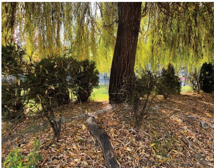
Figure 7. Plants between the roots of Salix alba 'Tristis' tree, Park Macedonia 1, 2023.

The rhythm and line design principle gives a landscape a sense of movement; it is what may draw one "into" the landscape and what makes landscapes calming to our soul (Sandborn 2015). However, this basic principle should be used carefully. It may be boring, with the feel of monotony, if the same form and the same colour are repeating all the time, such as in Park Macedonia 1 for example (representatives of Fraxinus excelsior 'Globosa', planted in line, extend along