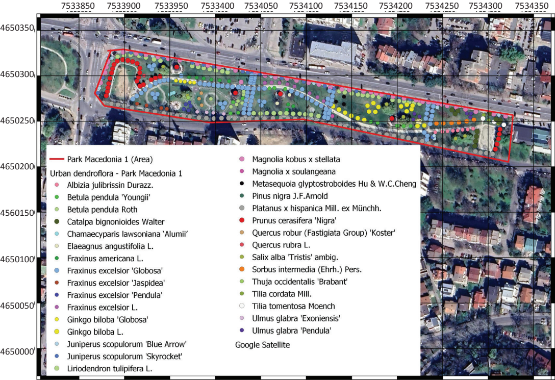
Figure 4. Urban dendroflora, Park Macedonia 1: QGIS (Coordinate Reference System MGI 1901 / Balkan zone 7, EPSG:6316), Google Satellite, 2023.