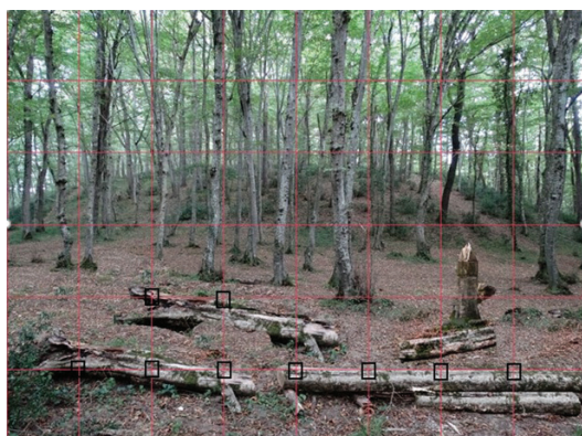
Figure 1. Oriental beech and hornbeam dominated the forest with a grid and intersection point.

Afterwards, the transpose of the vector of the weights w is multiplied by matrix A to obtain the vector represented by I_{max} w , which follows the principle: