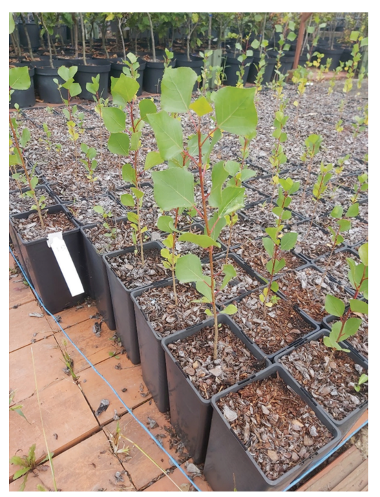
Figure 5. Black poplar plants in individual containers.

a height increase of at least 1 cm since the first transplant and plants that had developed more than two leaves were selected. The plants in the containers were arranged in the open germinator in the nursery of the Croatian Forest Research Institute, where they were watered and health condition was monitored on a regular basis.