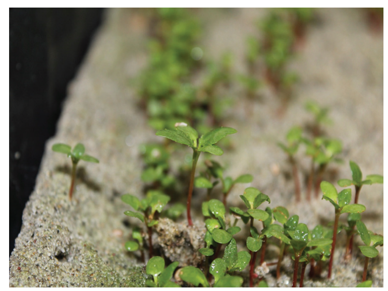
Figure 3. Seedlings of European black poplar.