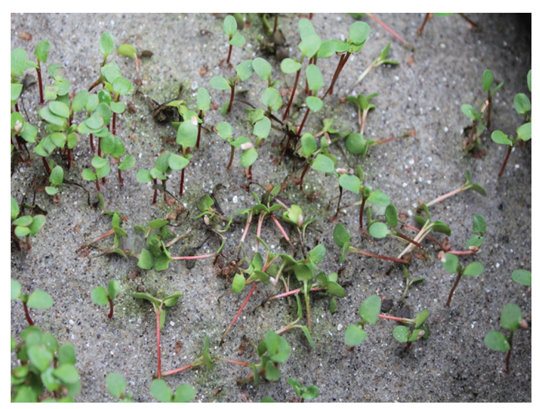
Figure 4. The appearance of fungal diseases on black poplar seedlings.

(the volume of each hole is 220 cm<sup>3</sup>)). When transplanting, plants that differed from the others were selected, i.e. all that had developed two leaves and reached an average height of 2 cm. A total of 499 plants were selected from the initial number, which was a rough estimate of 3,000 seedlings. From 5,000 sown seeds, about 3,000 seedlings were obtained, indicating a germination rate of 60%. Transplanting was done towards the end of June, before the summer heats. The containers were previously filled with a mixture of neutral peat (DURPETA PROFI MIX 1a) and Drava sand (granulation 0.2 mm) in a ratio of 250 l of peat and 50 l of Drava sand. The transplanted plants were moved from