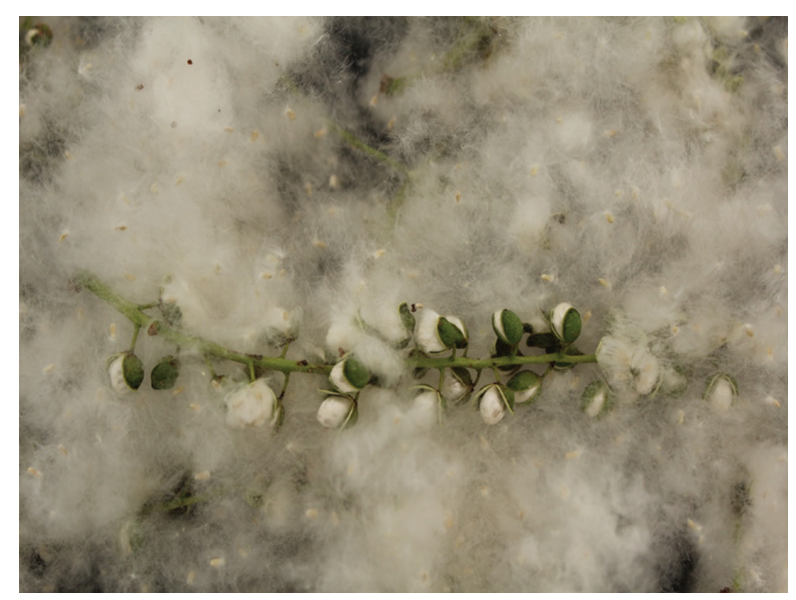
Figure 2. Opened seed capsules on catkin from which black poplar seeds have emerged.

With the appearance of the first leaves and the strengthening of the plants, the conditions were created for the first transplant into individual holes in 18 Bosnaplast plastic containers (32x21.5x18 cm, 33 holes in the block