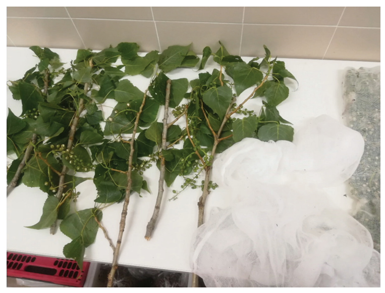
Figure 1. Collected branches with catkins containing black poplar seeds.

In the selected natural stand, based on good phenotypic appearance and health status, a female tree was selected in April 2019. The selected tree was fallen because it had already been marked previously, i.e., scheduled for felling in the same year. Ten 1 m long top branches with catkins (early ripening seed capsules) were cut from the felled tree to obtain seed material (Figure 1).