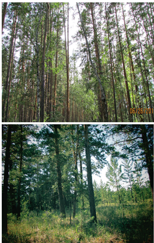
Figure 1. Pure Scots pine (upper image), and birch and Scots pine mixed forest (lower image) where samples were collected.

During the identification of fruiting bodies, standard methods were applied, using the available identifiers such as the resource www.indexfungorum , as well as the web-sites on "Mushrooms of the Kaluga Region" and "Mushrooms of the Novosibirsk Region". Micromorphological studies of characters were performed under the light microscope (Altami SMO745-T, St. Petersburg, Russia), at 400×–1000× magnification. To identify the natural color of the microstructures, the preparations were viewed in distilled water and in a 3–5% KOH solution. Hyaline structures were stained with a 5% aqueous solution of safranin, while the presence or absence of amyloid and dextrinoid structures was determined using Meltzer's reagent. To determine the type of fungal symbiont in the ectomycorrhiza, the morphotyping method was used according to Agerer (2008). For these purposes, soil blocks (10×10×20 cm in size) were taken within the projection of the crown of mature trees, according to the method of concentric sampling (Smith and Smith 2011). Before sampling, the upper undecomposed layer of the litter was removed. Coniferous seedlings were extracted from the soil with the most intact root system. Moreover, DNA was isolated