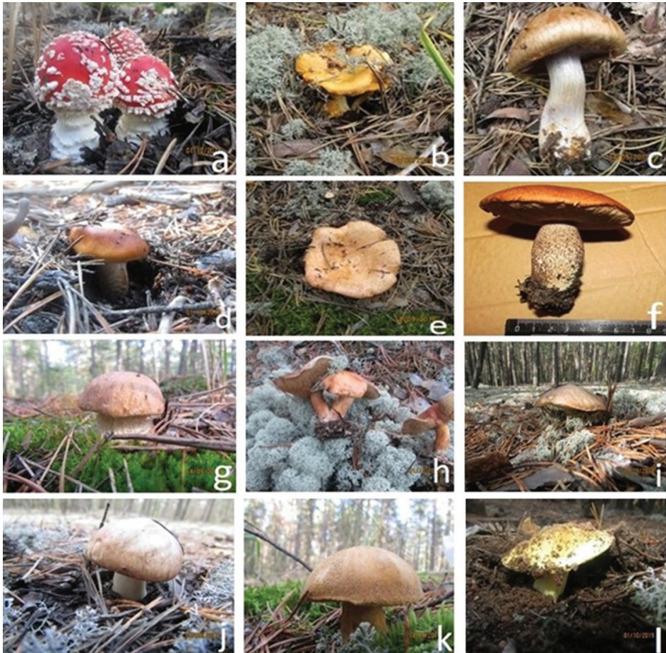
Figure 3. Representative photos of the macromycetes identified in this study: (a) Amanita muscaria ; (b) Cantharellus cibarius ; (c) Cortinarius nemorensis ; (d) C. mucosus ; (e) Lactarius delicious ; (f) Leccinum aurantiacum ; (g) L. scabrum ; (h) Suillus bovinus ; (i) S. luteus ; (j) S. sibiricus ; (k) S. variegatus ; (l) Tricholoma equestre .